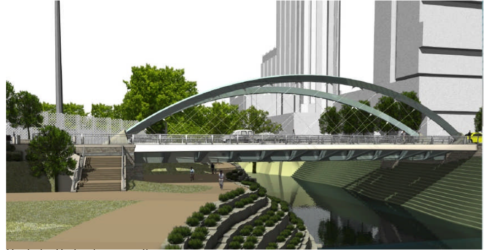
Seaholm Bridge (proposed)