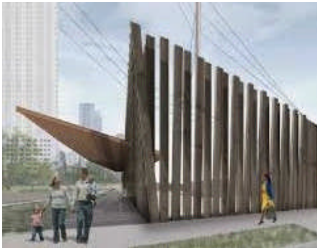
Seaholm Wall (proposed)