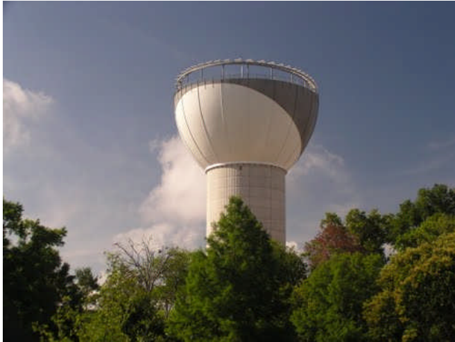
Mueller Water Tower