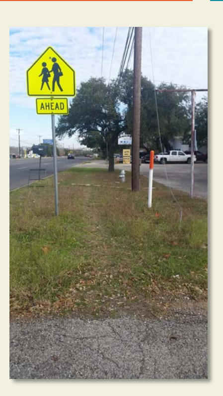
Improvements that can be field engineered