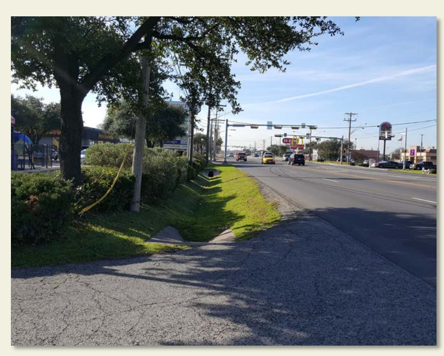
Improvements that require detailed design