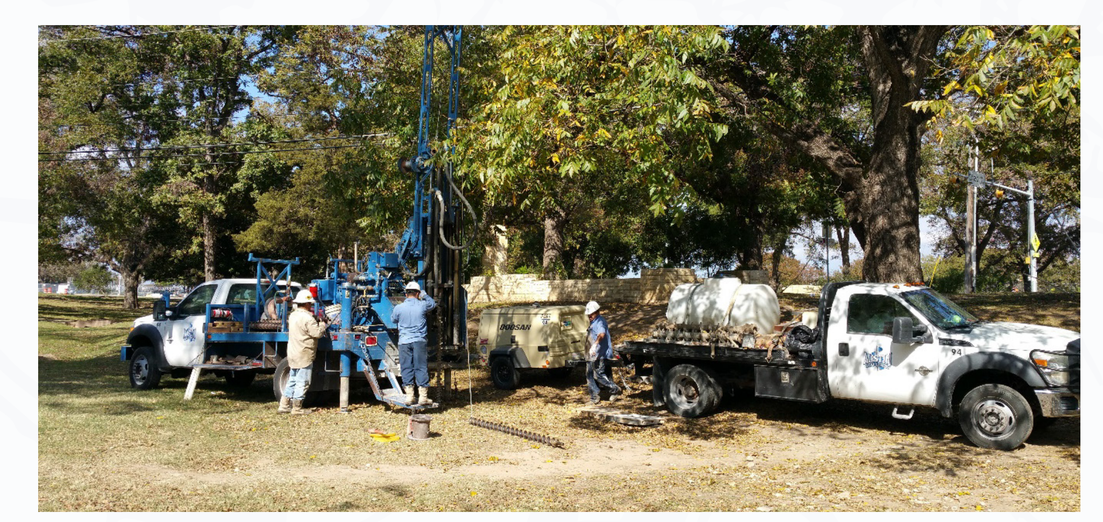
Geotechnical Borehole Drilling for subsurface conditions

In 2020, the project is entering the Design Phase. As a result, you may notice various crews in the road and bridge vicinity gathering field data and information for design.