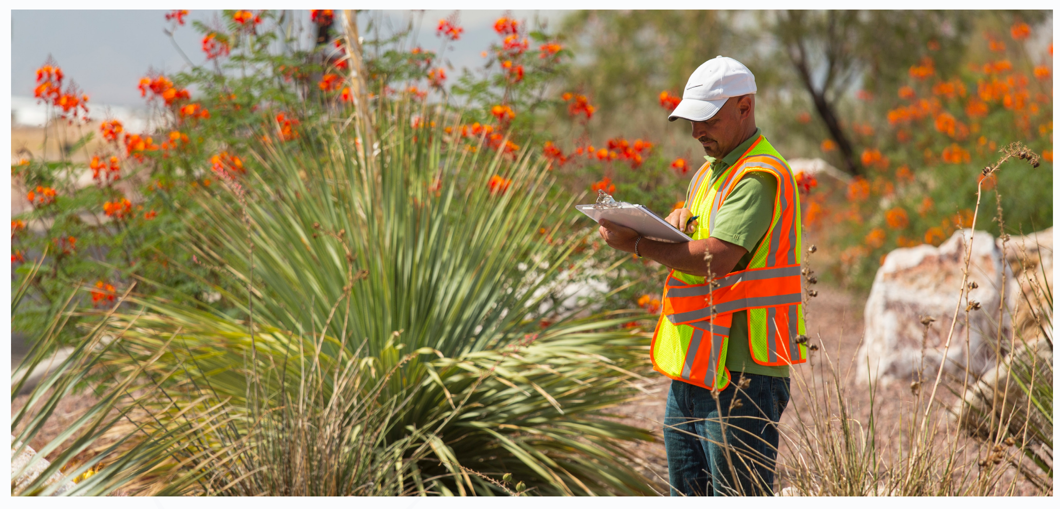
Environmental Field Staff to identify sensitive features