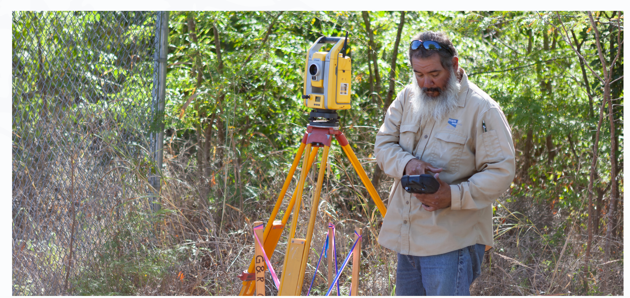
Survey Crews to identify topography and existing conditions