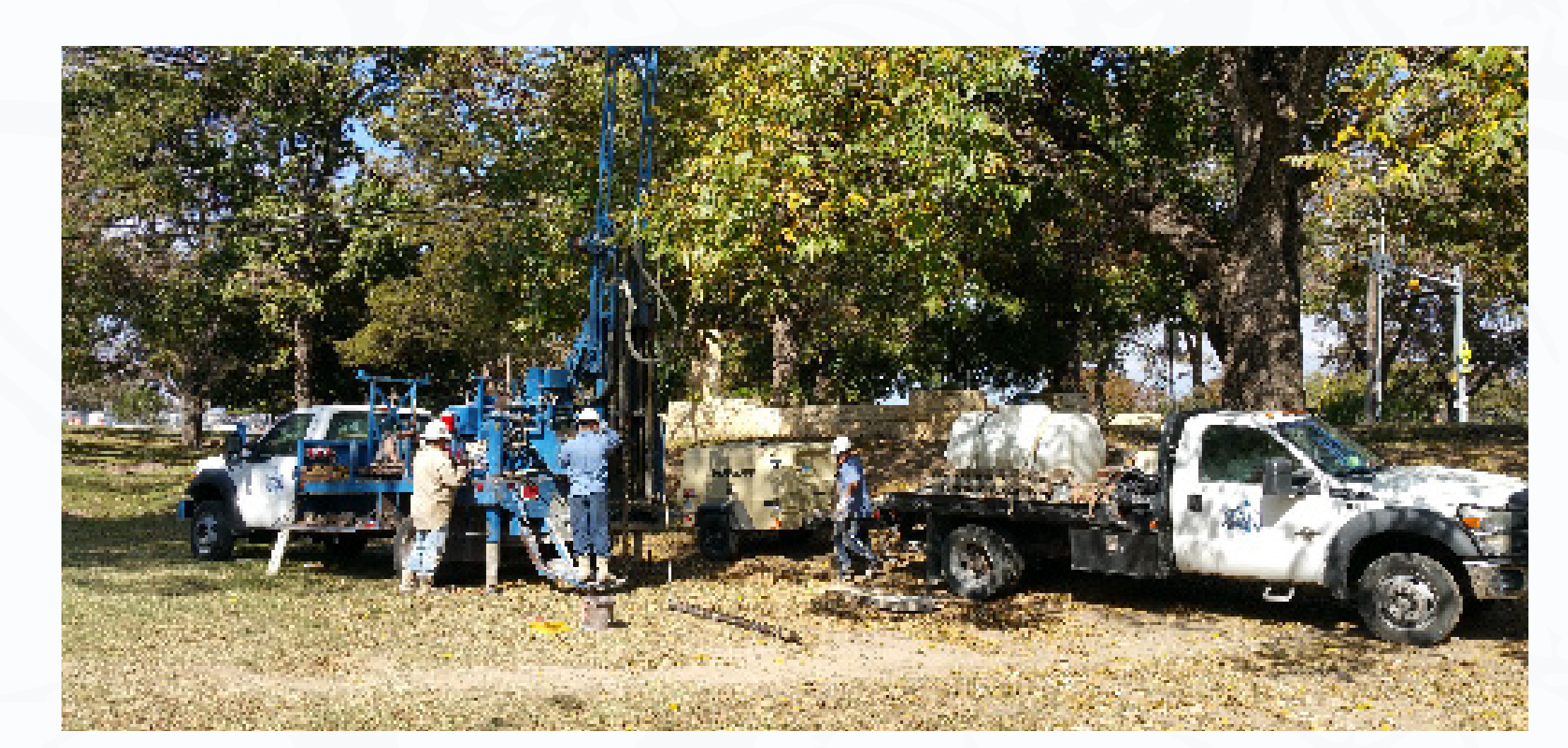
Geotechnical Borehole Drilling for subsurface conditions

As a result, you may notice various crews in the road and bridge vicinity gathering field data and information for design. Bridge maintenance activities will also take place in 2019.