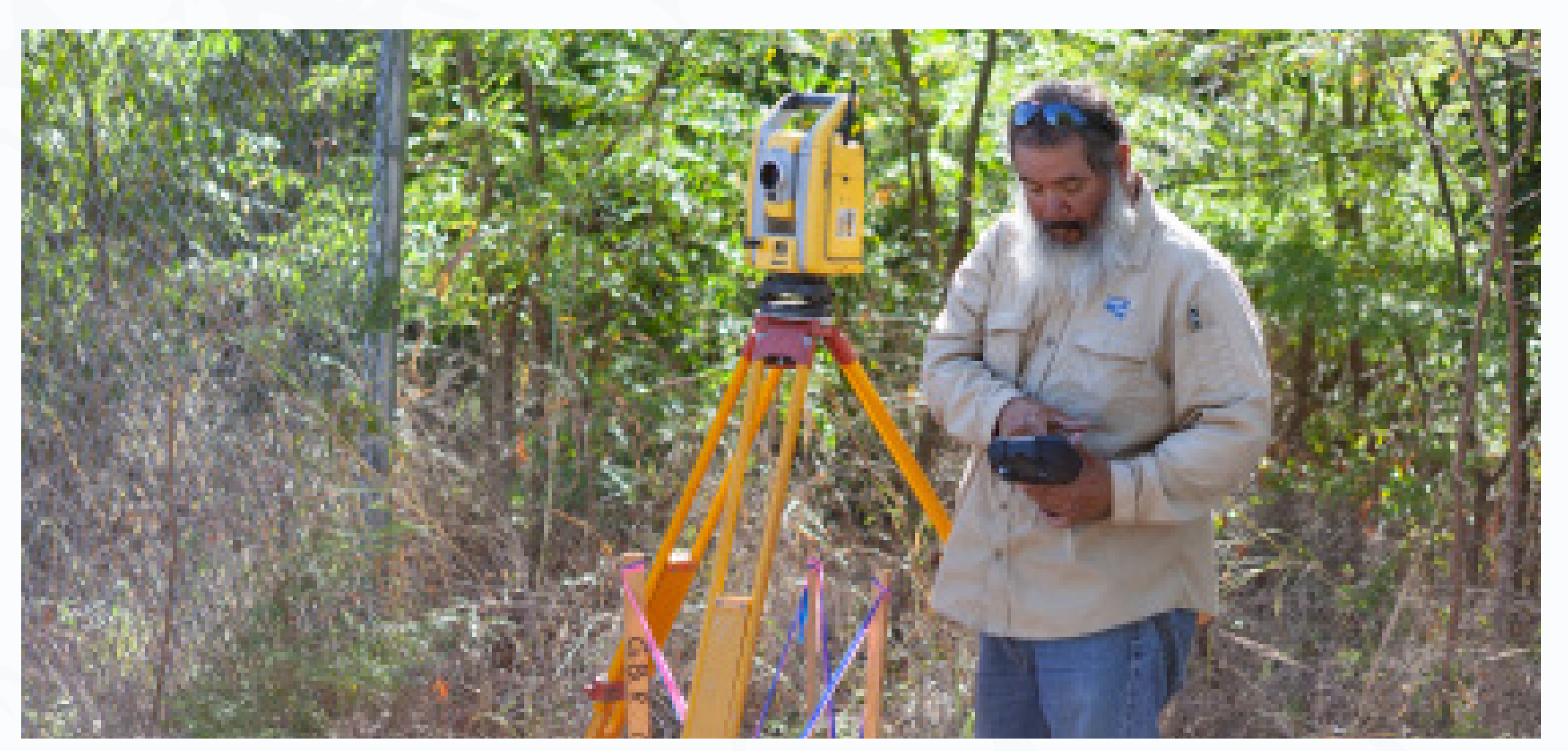
Survey Crews to identify topography and existing conditions