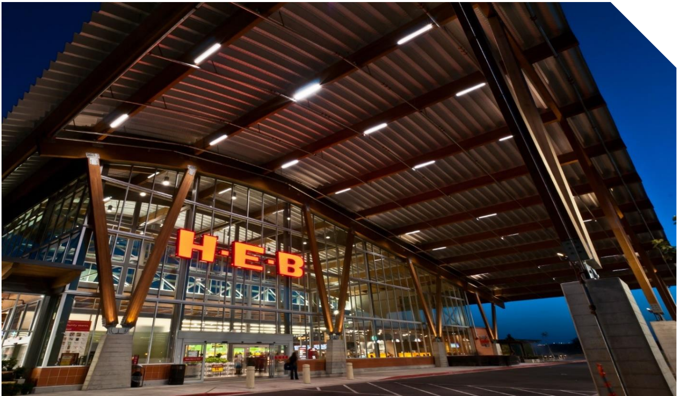
At the Mueller HEB, an innovative propane refrigeration system with zero ozone depletion potential and very low global warming potential allows for 95% less refrigerant than conventional systems. (AEGB 4-Star Rating and LEED® Gold Certification)